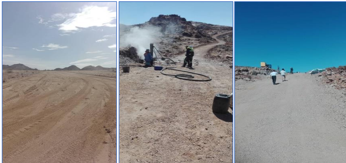
Figure 2 – Completed road between nearest traversable road to Swanson Plant

Construction of the Water Pipeline and installation of the Powerline for NamPower electricity provision is set to commence in the second quarter of 2024. Site preparation has commenced at the Swanson Plant by HeBei Construction but Civil Works has been slightly delayed until the appointment of an experienced Project Manager (expected to be appointed in May 2024) to coordinate project readiness and construction.