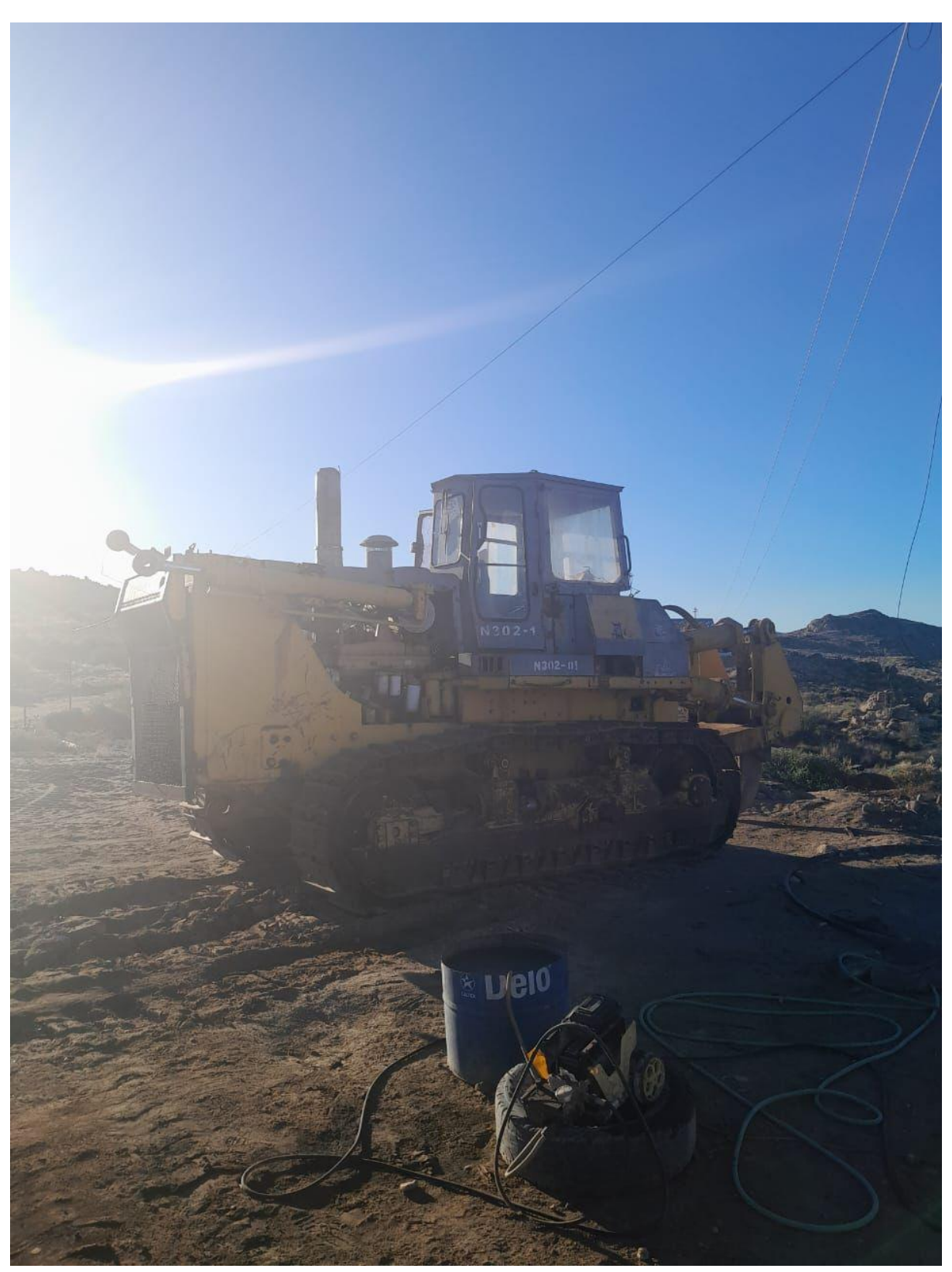
Figure 5 – Dozer used to clear rocks and tree roots in the vicinity of the roads