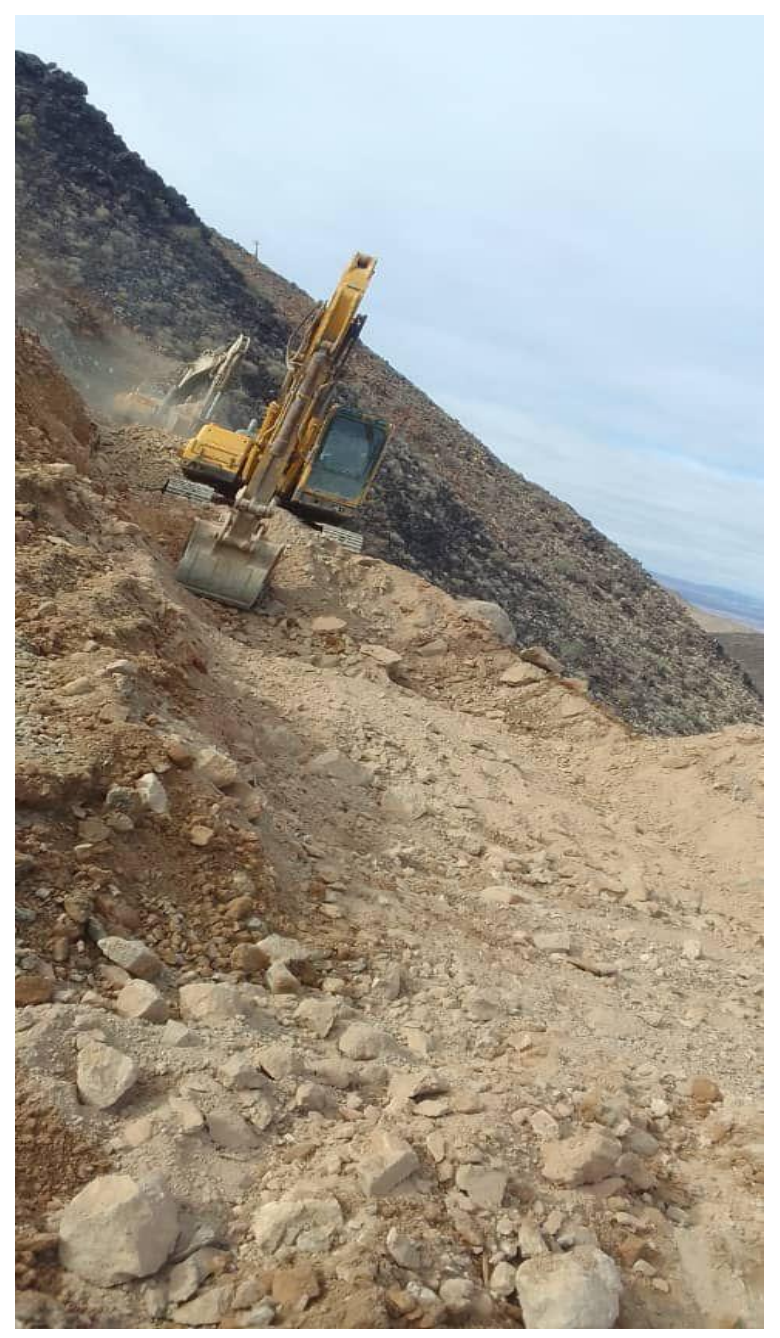
Figure 1 – Roadworks being undertaken between the Swanson mine site and the location of the plant.