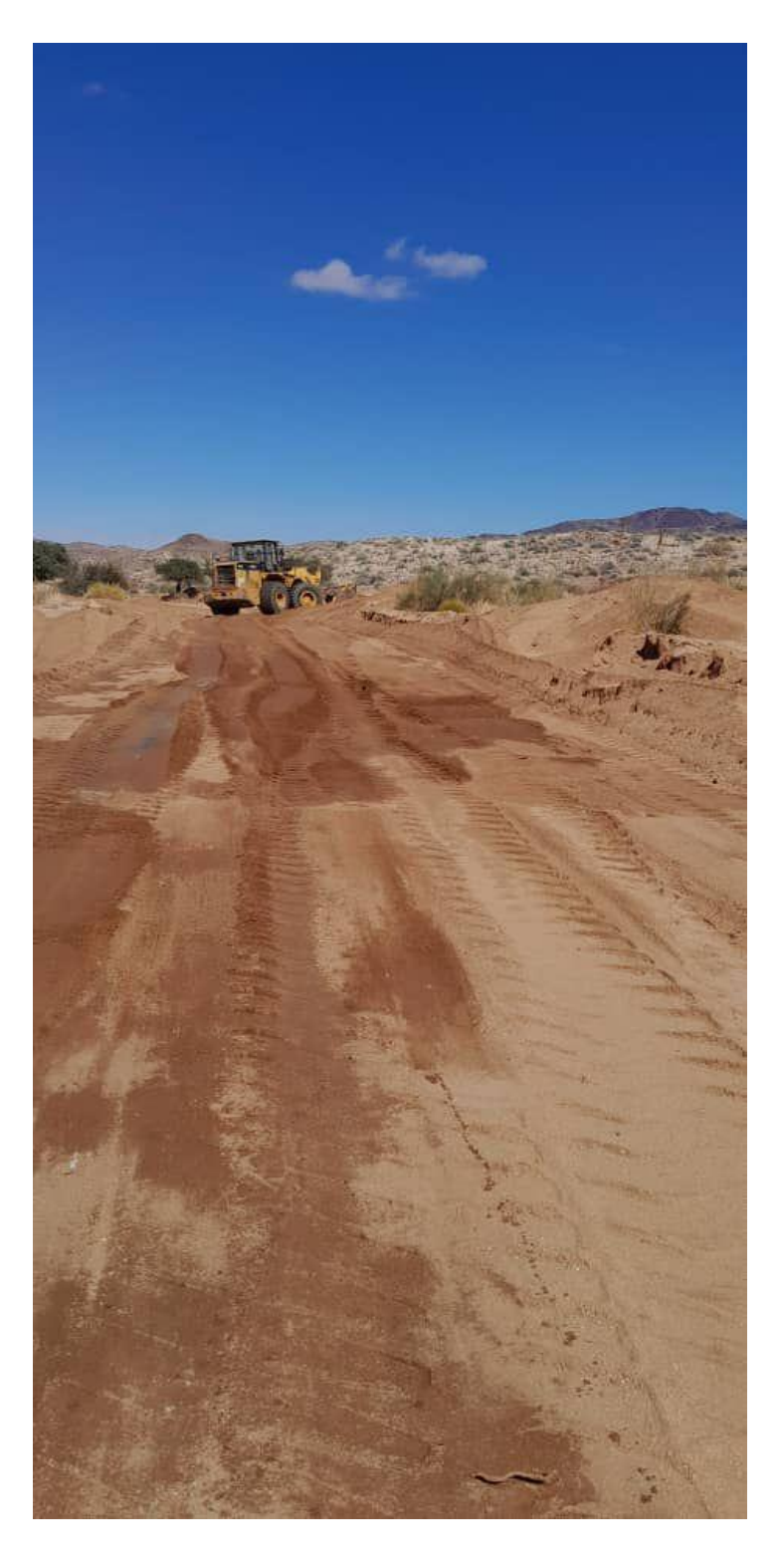
Figure 3 – Road construction to the plant location.