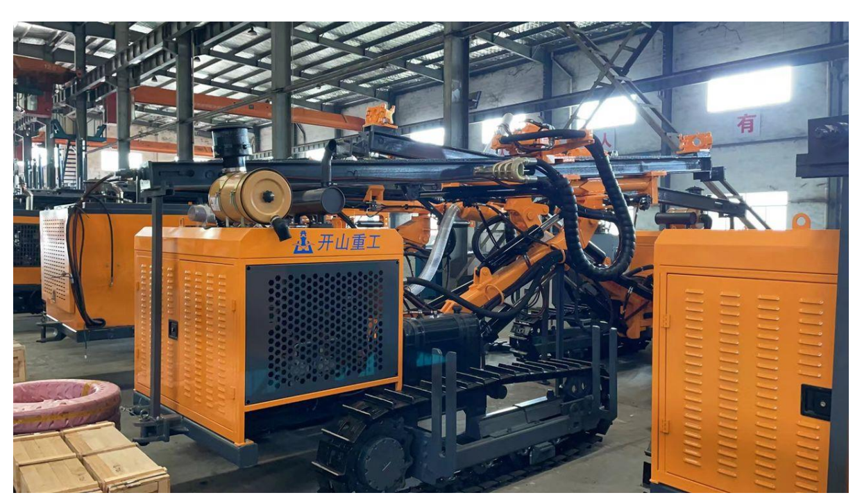
Figure 6 – Drill machine ordered