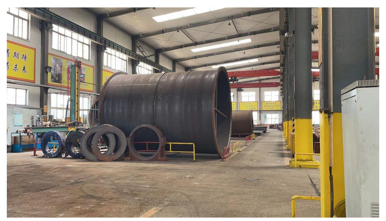
Figure 7 – Ball mill ordered