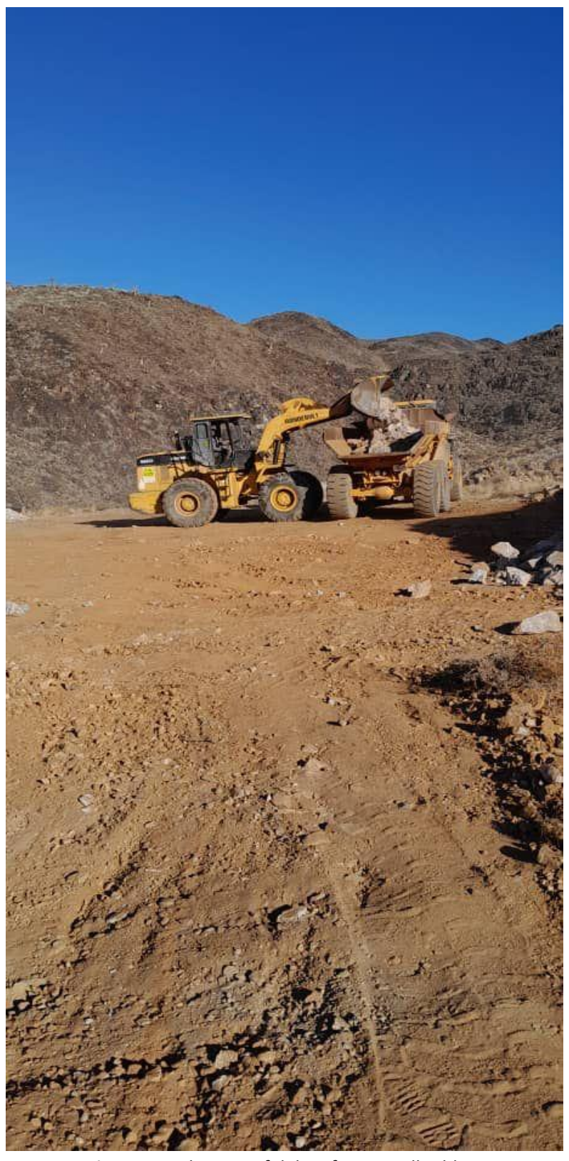
Figure 4 – Clearing of debris from roadbuilding