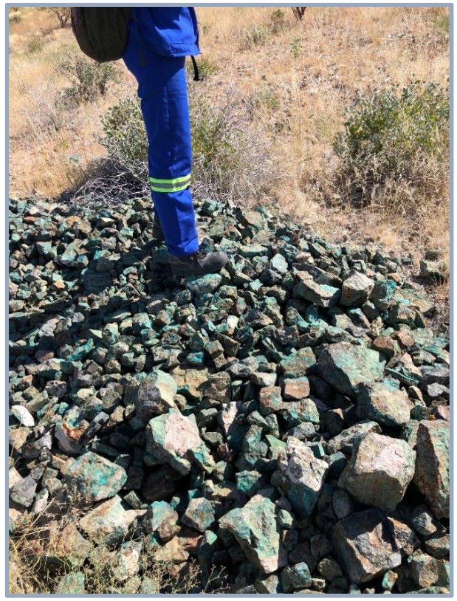
Figure 7: Example 2 of historical workings on the copper rich zones (oxides; chrysocolla, malachite and subordinate azurite whereas sulphides are chalcopyrite, bornite and chalcocite) hosted within the calc-silicates