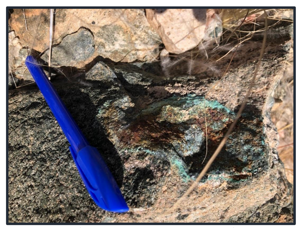
Figure 3: Skarn altered (tremolite-actinolite, diopside and epidote) mineralised marble