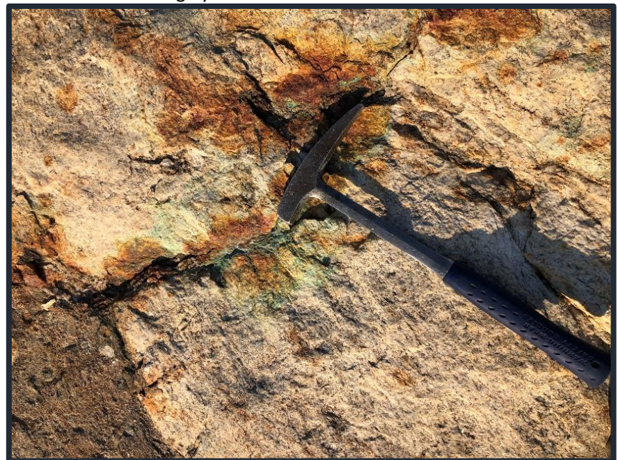
Figure 2: A mineralised ferruginous Quartz vein containing gold, copper and pyrite crosscutting a calc-silicate and granitic dike