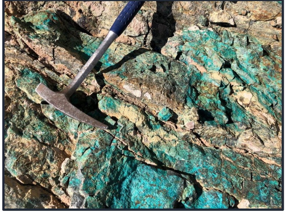
Figure 4: Outcropping copper mineralisation (malachite, chrysocolla and relicts of chalcopyrite) hosted by a silicified calc-silicate unit.