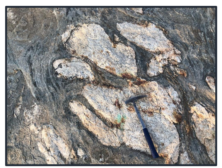
Figure 1: Endo-skarn granitic boudin Cu mineralisation with partly oxidized pyrrhotite within the highly deformed Marble-calc silicate