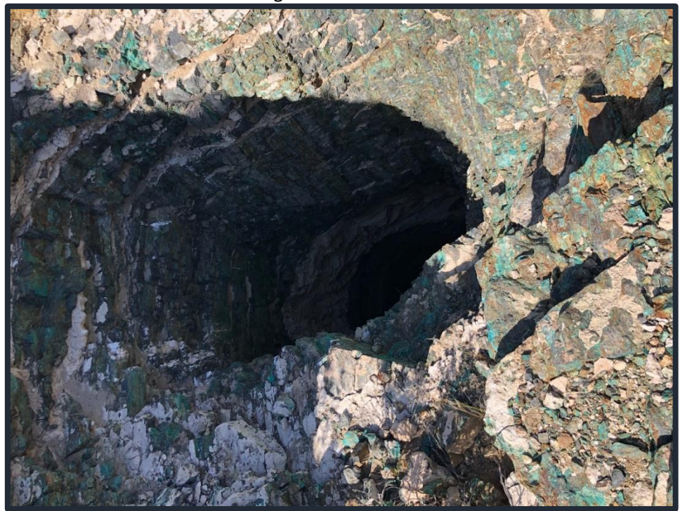
Figure 6: Example 1 of historical workings on the copper rich zones (oxides; chrysocolla, malachite and subordinate azurite whereas sulphides are chalcopyrite, bornite and chalcocite) hosted within the calc-silicates