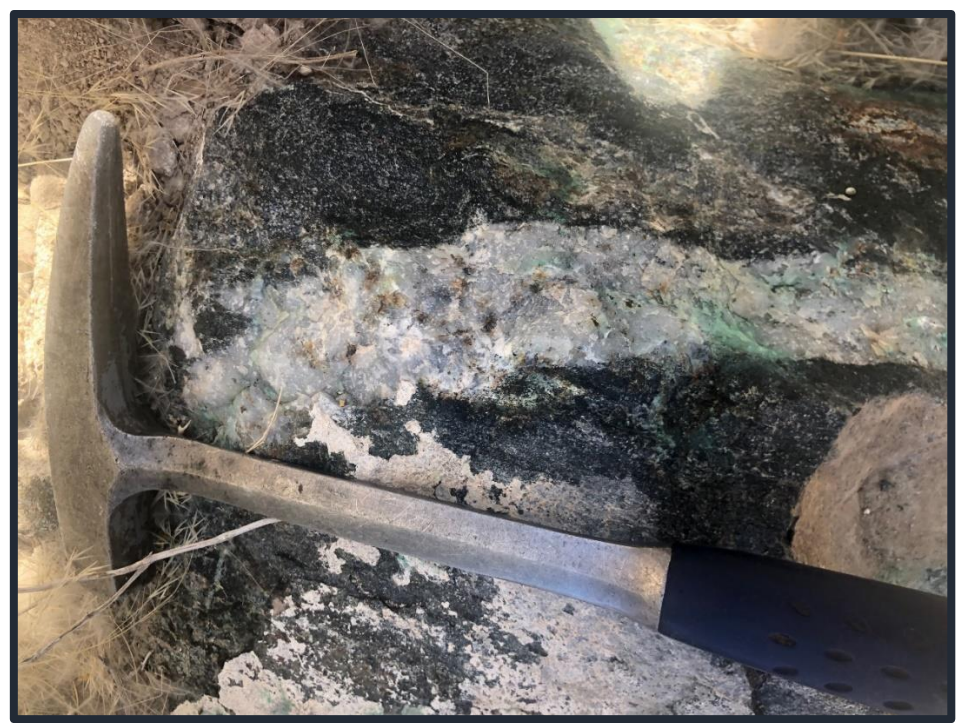
Figure 5: Pyrrhotite and minor malachite stained quartz vein, part of the sheeted quartz veins being targeted in the schists